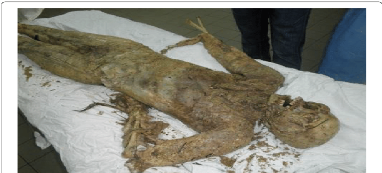
Fig3; - Skeletonization of dead body after 2-4 weeks of death.

Skeletonization , normally the human body starts to get skeletonized within in 2-4 weeks, but it depends on condition of body, temperature of the region or weather also. In case of wild animal's attack over the body then, time gets reduced.